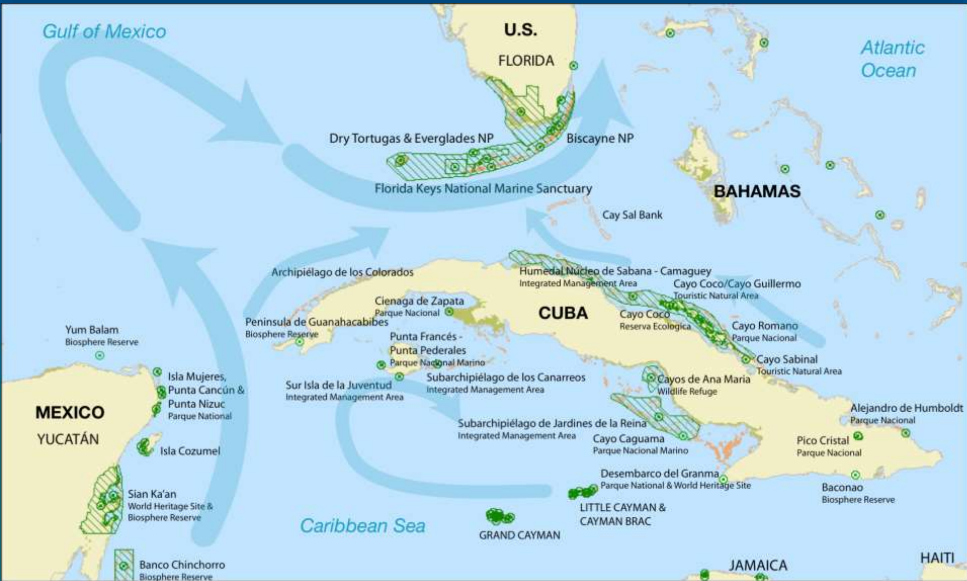
Major Marine Conservation Areas of Cuba, Yucatán and South Florida Showing Dominant Current Flow Patterns